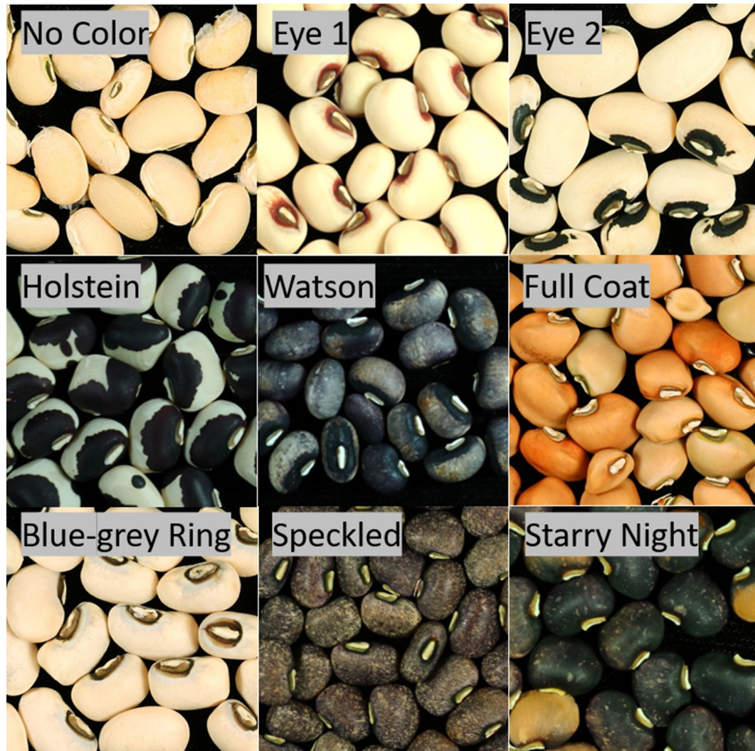
FIGURE 1 | Seed coat pattern traits. Images of lines from various populations demonstrating the phenotypes which were scored as part of this study.

A genotyping array for 51,128 single nucleotide polymorphisms (SNP) was recently developed for cowpea (Muñoz-Amatriáin et al., 2017) which offers opportunities to improve the precision of genetic mapping. Numerous biparental populations have been used to map major quantitative trait loci (QTL) for various traits, including root-knot nematode resistance (Santos et al., 2018), domestication-related traits (Lo et al., 2018), and black seed coat color (Herniter et al., 2018) and to develop consensus genetic maps of cowpea (Muchero et al., 2009; Lucas et al., 2011; Muñoz-Amatriáin et al., 2017). In addition, new populations have been developed for higher-resolution mapping including an eight-parent Multi-parent Advanced Generation Inter-Cross (MAGIC) population containing 305 lines (Huynh et al., 2018).