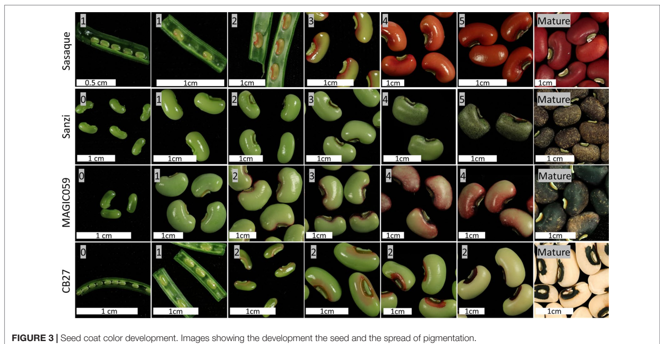
FIGURE 3 | Seed coat color development. Images showing the development the seed and the spread of pigmentation.

Based on the above proposed allelic series, an individual with the C_0C_0 genotype will express the No Color pattern, regardless of the genotypes at the W and H loci, and an individual with the C_1C_1 genotype will express the Eye 1 pattern, regardless of the genotypes at the W and H loci. However, when not constricted by a C_0 or C_1