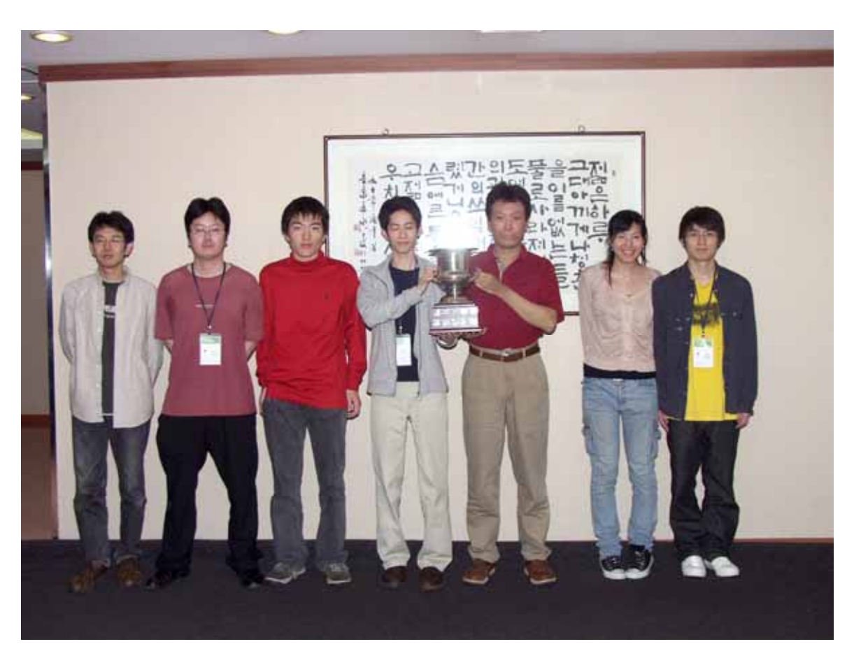
Japan - Youth Champion