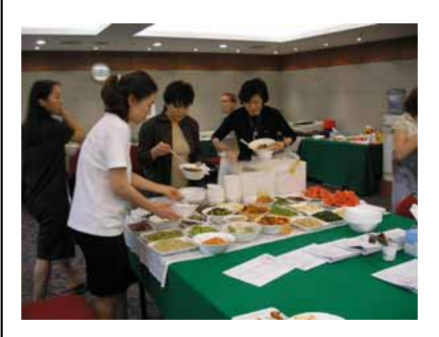
Eating is more important than anything - Staff lunch time

Photos, Photos, Photos! 1) Go to the PABF Website: <u>http://kcbl.org/pabf2005/main</u> <u>pabf_index.htm</u> 2) click on information. 3) Then, on the next page click on photos.