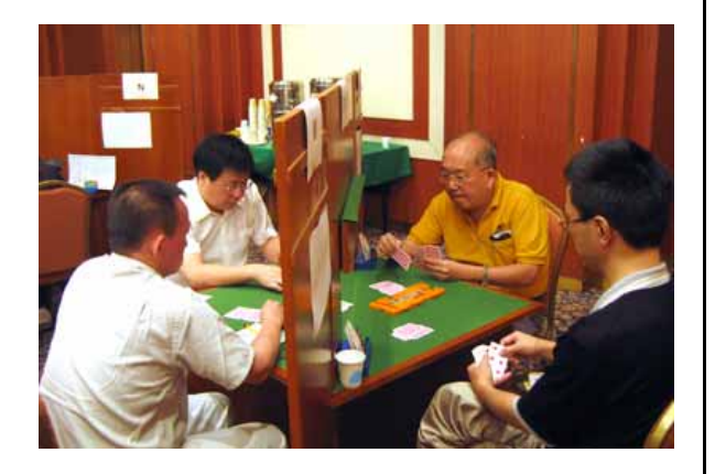
China vs Singapore

Strangely, in Australia vs. HK 3NT was flat, making. Even if West gets off to the \bigstar K as a starter (South played it both times) it looks like ducking 2 diamonds is enough to get 3NT home one way or another.