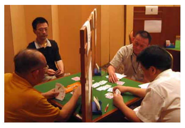
China vs Singapore