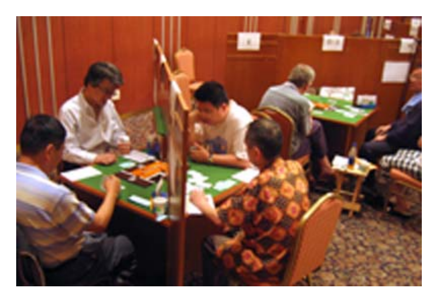
Hard at Play at the 2005 PABF Championships

It is entirely up to you as reader to work this one out first.