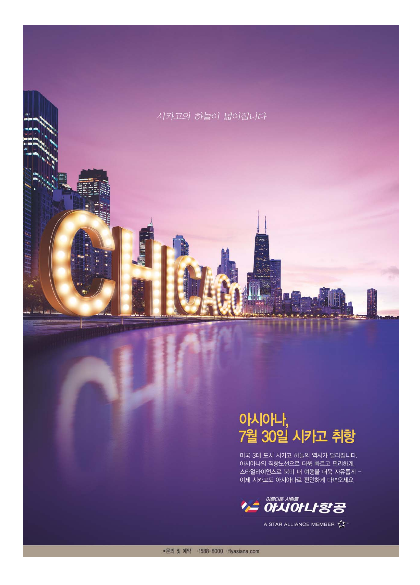
Asiana: major sponsor of the 43rd PABF Championships