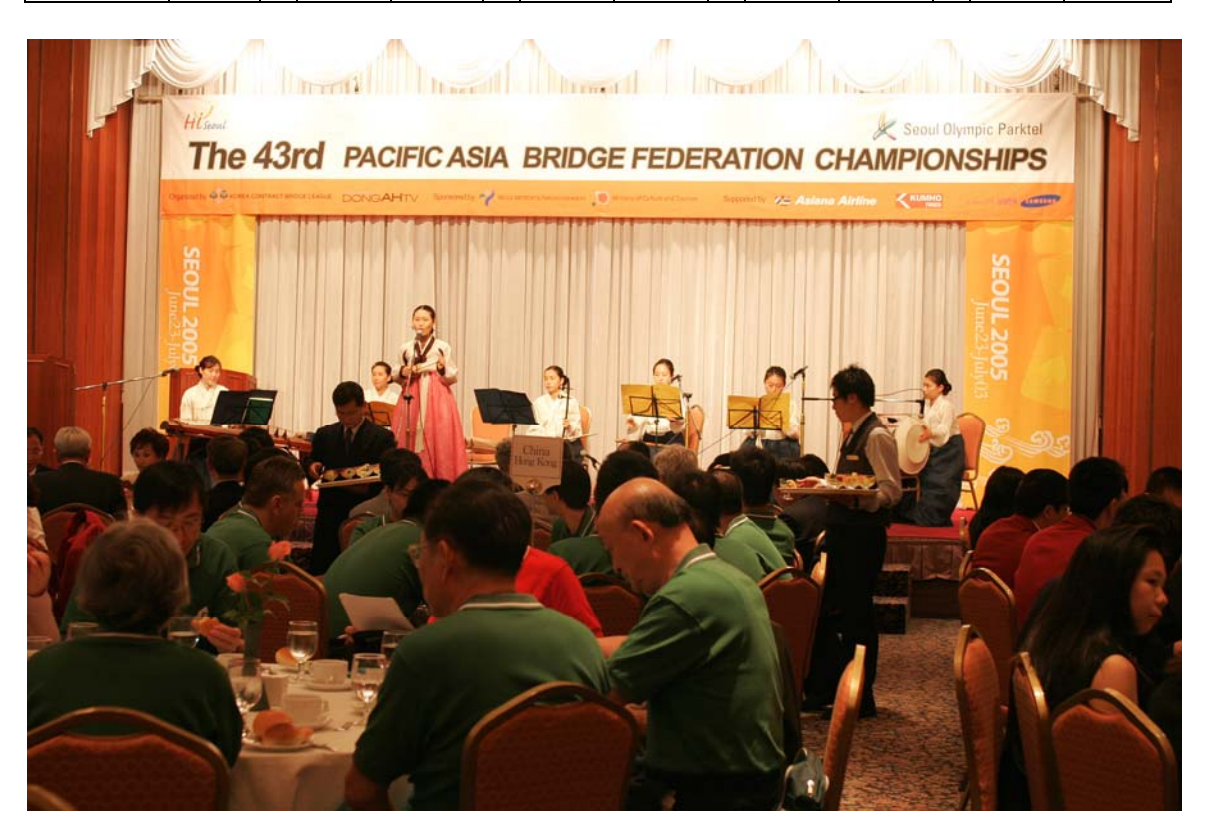
Opening Lunch: Performing Traditional Korean Musicians