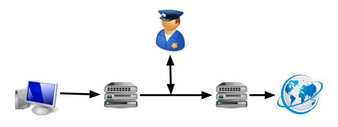
Figure 1: Threat Model

This observation has motivated work on TCP reset attack evasion. For example, Khattak et al. [17] manually crafted a fairly comprehensive set of the evasion strategies at the TCP and HTTP layers against the GFW and verified them successfully in a limited setting with a fixed client and server. Unfortunately, there are a large number of factors that were not taken into account ( e.g. , different types of GFW devices may be encountered on different network paths, various middleboxes may interfere with the evasion strategies by dropping crafted packets).