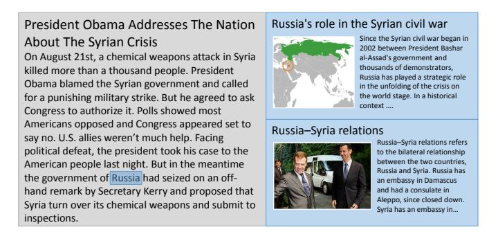
Figure 1: Contextual Insights experience.

At a high level, the input to the contextual insights problem consists of: 1) A focus of attention , 2) a context , and 3) a