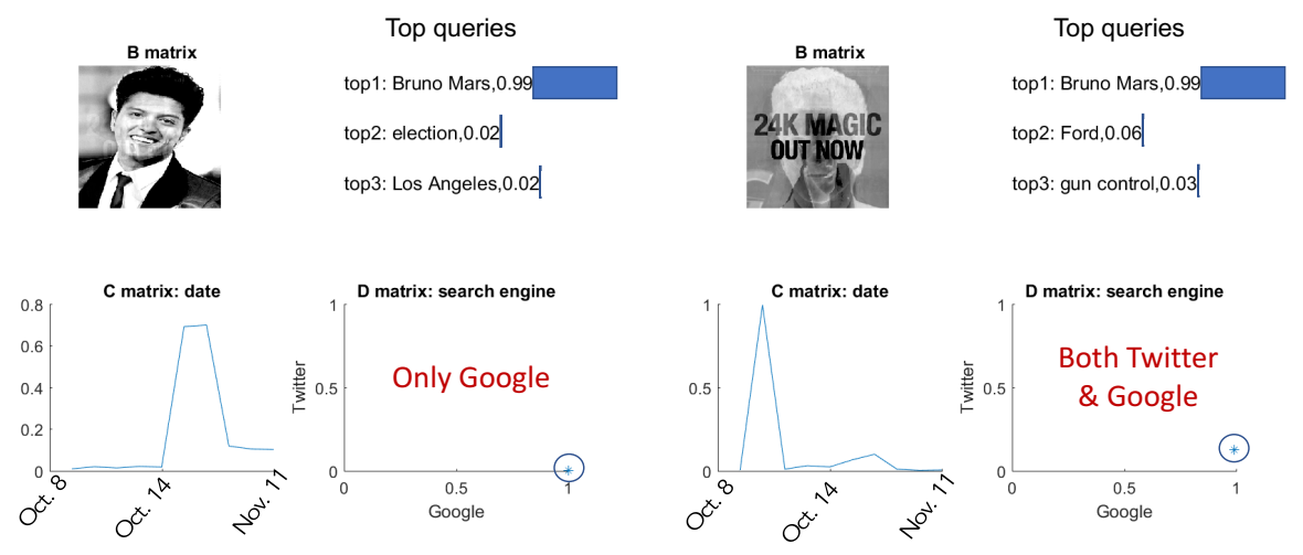
Figure 3: Two different CP components for "Bruno Mars".